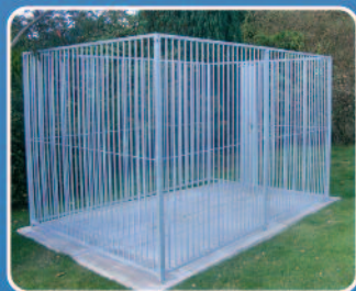
3m x 1.5m 8cm bar run €390

slaney's kennel solutions www.dogkennel.ie