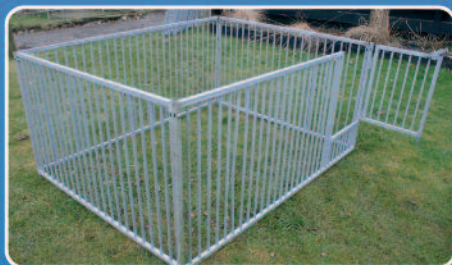
Puppy panels from €50