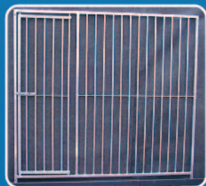
Individual panels - gates - full - 4 types