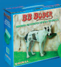
Auto drinkers - hopper feeders