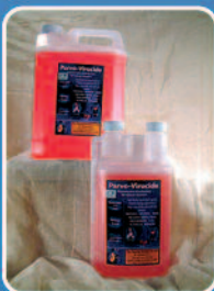
Parvocide disinfectant /odour kill from €15