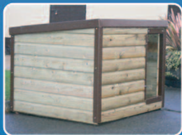
Dog cabins from €200 - removable lid